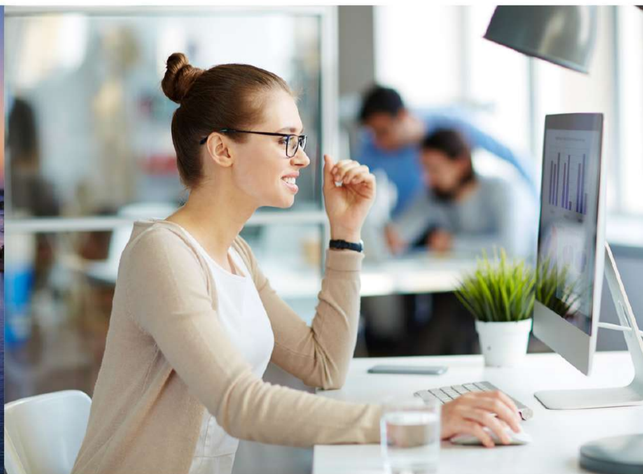
Finances & Accountant